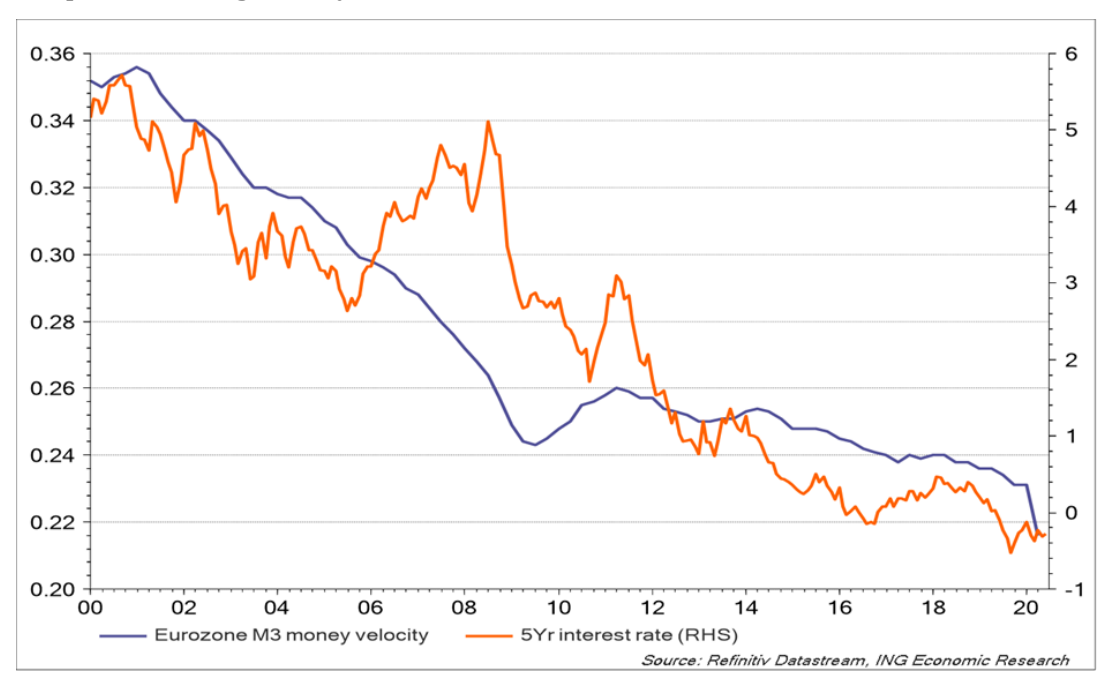
Graph 2: Declining velocity

To illustrate these points you only have to look at what happened in Japan over the last few decades. Since 1997, base money has increased by a whopping 970%, while consumer prices over the same period have basically remained unchanged. In other words, the increase in the ECB's balance sheet through the purchase of additional government bonds doesn't need to lead to significantly higher inflation, though of course the amount of government bond purchases without causing higher inflation, is not limitless either.